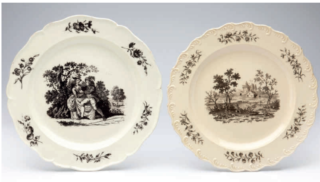
30. A creamware plate, printed in black with lovers in a wooded landscape, sheep beyond, the indented border printed with flower sprays, 10" diameter, circa 1780, no mark