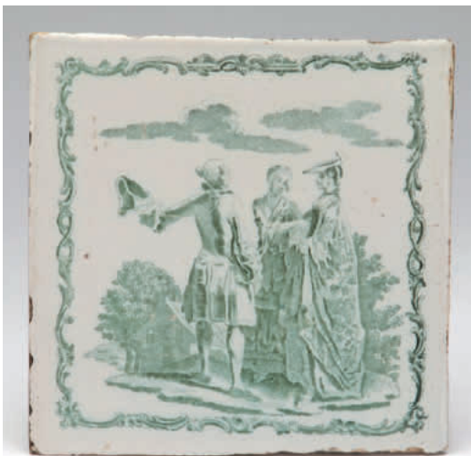
67. A Liverpool Delft tile, printed in black with A Gentleman Doffing His Cap to Two Ladies, within a scroll border, 5" square, circa 1765-70