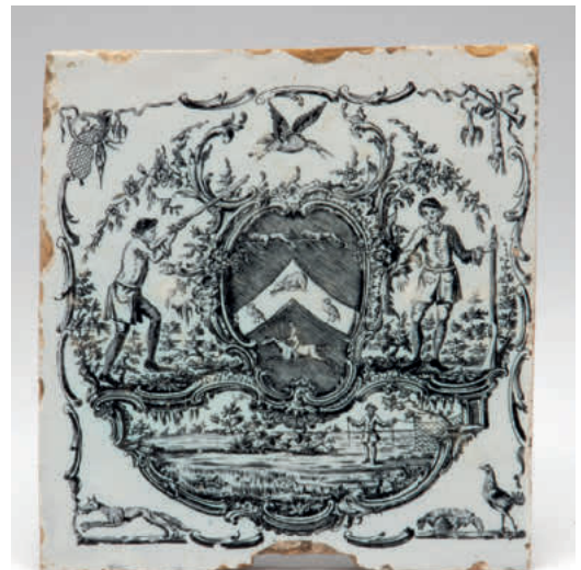
64. A Liverpool Delft tile, printed in black with The Sportsman's Arms, within an elaborate scroll and emblem border, 5" square, circa 1757-61