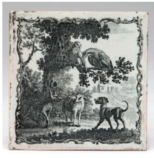
44. A Liverpool Delft tile, printed in black with the fable of The Dog and the Sheep (Croxall CXXX), within a scroll border, 5" diameter, circa 1765-70