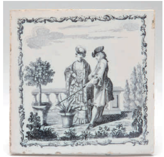
70. A Liverpool Delft tile, printed in black with A Lady and Gentleman in a Garden Admiring an Orange Tree, within a scroll border, 5" square, circa 1757-61