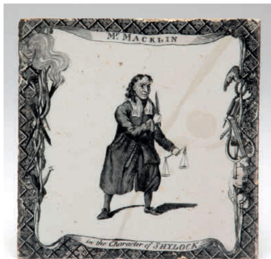
38. A Liverpool Delft Theatrical tile, printed in black with 'Mr Macklin in the character of SHYLOCK', within a titled trellis and trophy border, 5" square, circa 1777-80