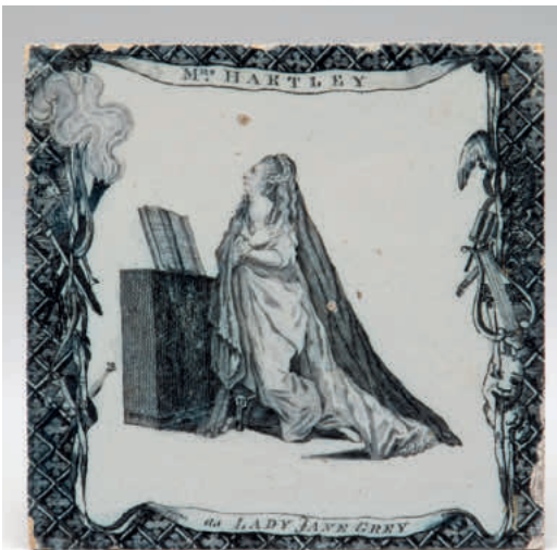
63. A Liverpool Delft Theatrical tile, printed in black with 'Mrs Hartley as LADY JANE GREY', within a titled trellis and trophy border, 5" square, circa 1777-80