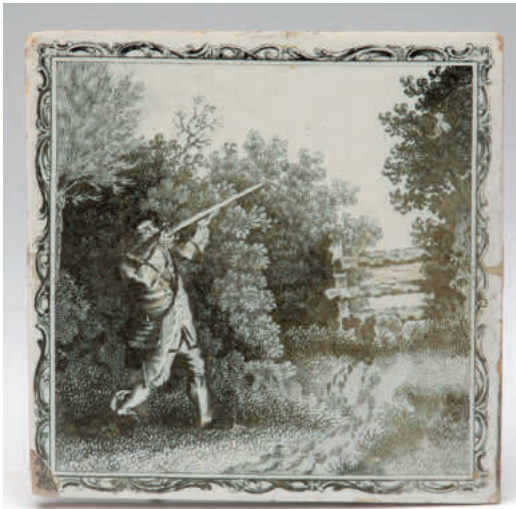
65. A Liverpool Delft tile, printed in black with the fable of The Fowler and the Ring-Dove, within a scroll border, 5" square, circa 1765-70