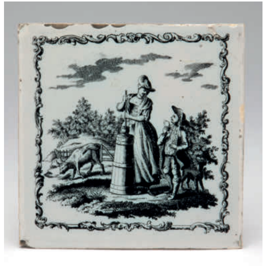
46. A Liverpool Delft tile, printed in black with A Woman Churning Butter, and a boy, within a scroll border, 5" square, circa 1755

This design is taken from Plate 45 of the John Bowles drawing book