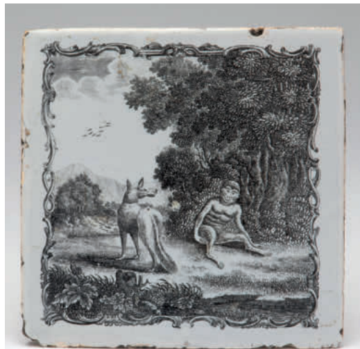
42. A Liverpool Delft tile, printed in black with the fable of The Ape and the Fox (Croxall CXXIII), within a scroll border, 5" square, circa 1765-70

This design is from a print after Brandoin