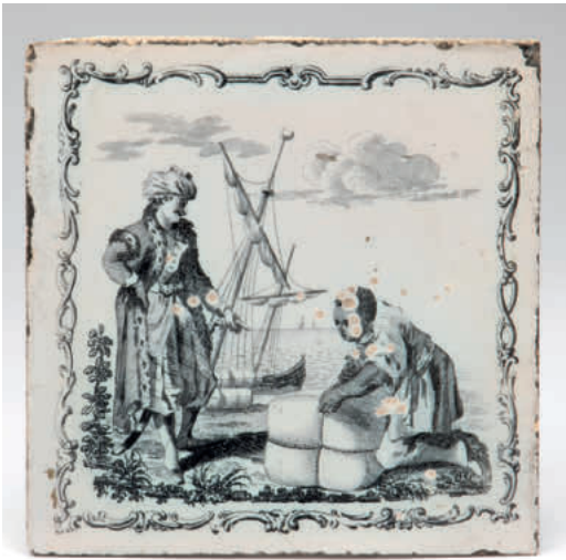
69. A Liverpool Delft tile, printed in black with The Turkish Merchant, within a scroll border, 5" square, circa 1765-70