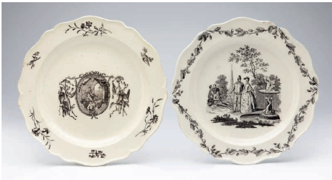
28. A creamware plate, printed in black with Britannia in an oval cartouche, titled 'LET WISDOM UNITE US', flanked by dead game, the indented border printed with flower sprays and birds on branches, 10" diameter, circa 1790, no mark