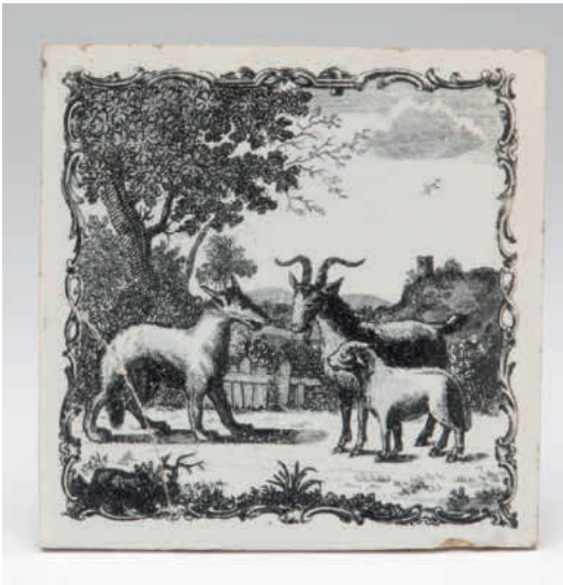
45. A Liverpool Delft tile, printed in black with the fable of The Lamb Brought Up by a Goat (Croxall XX), within a scroll border, 5" square, circa 1765-70