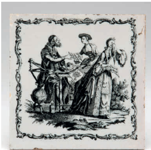
51. A Liverpool Delft tile, printed in black with The Astrologer – the fortunate girl with a scroll inscribed 'A brisk husband soon', the unfortunate girl with a scroll inscribed 'Never to be married', within a scroll border, 5" square, circa 1765-70