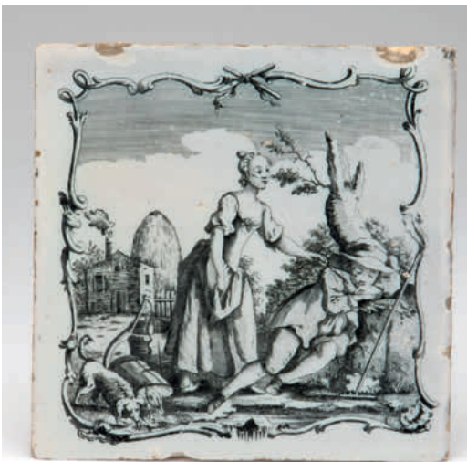
47. A Liverpool Delft tile, printed in black with The Overturned Milk Pail, within a scroll border, 5" square, circa 1755

This design is taken from Plate 45 of the John Bowles drawing book