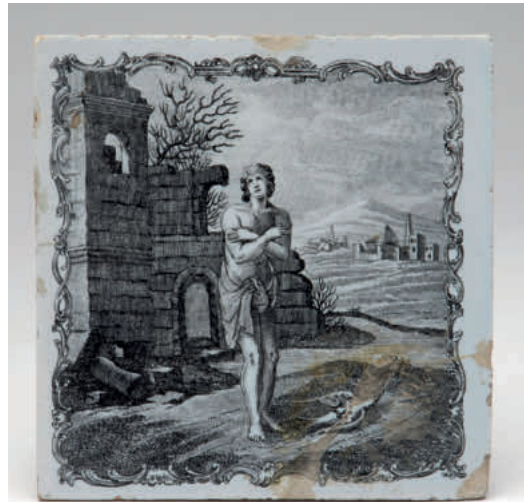
66. A Liverpool Delft tile, printed in black with the fable of The Young Man and the Swallow (Croxall LXX), within a scroll border, 5" square, circa 1765-70