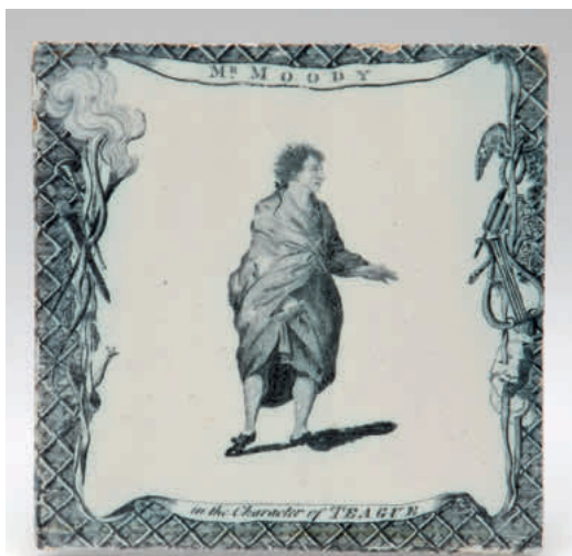
55. A Liverpool Delft Theatrical tile, printed in black with 'Mr Moody in the Character of TEAGUS', within a titled trellis and trophy border, 5" square, circa 1777-80