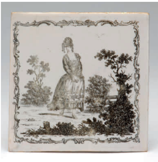
43. A Liverpool Delft tile, printed in black with 'A Modern Demi-rep on the Look-out', within a scroll border, 5" square, circa 1772-75