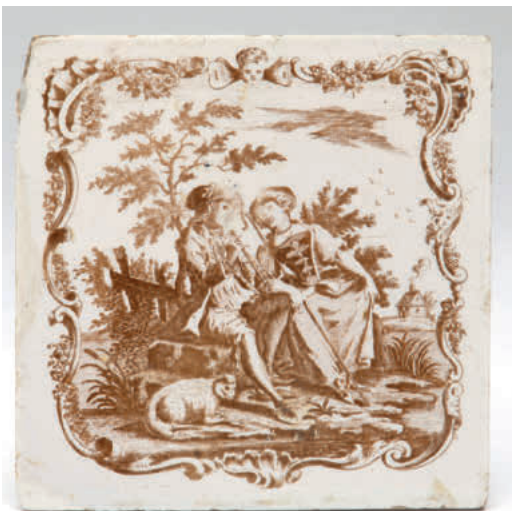
71. A Liverpool Delft tile, printed in sepia with A Shepherd Piping to a Shepherdess, within an angel mask and 'C' scroll border, 5" square, circa 1760

This tile is sometimes found signed J Sadler, Liverpool