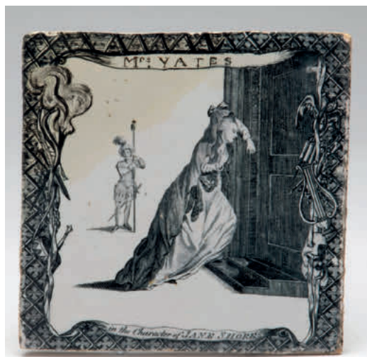
56. A Liverpool Delft Theatrical tile, printed in black with 'Mrs Yates in the Character of JANE SHORE', within a titled trellis and trophy border, 5" square, circa 1777-80