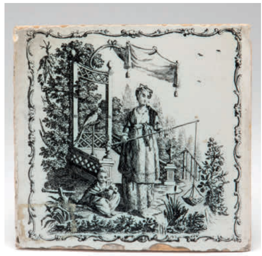
52. A Liverpool Delft tile, printed in black with A Chinese Woman Fishing, Accompanied by a Boy, within a scroll border, 5" wide, circa 1765-70