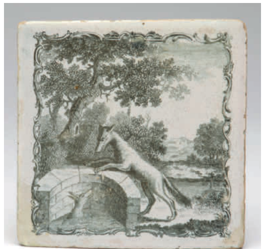
68. A Liverpool Delft tile, printed in black with the fable of The Fox in the Well (Croxall CLXVI), within a scroll border, 5" square, circa 1765-70