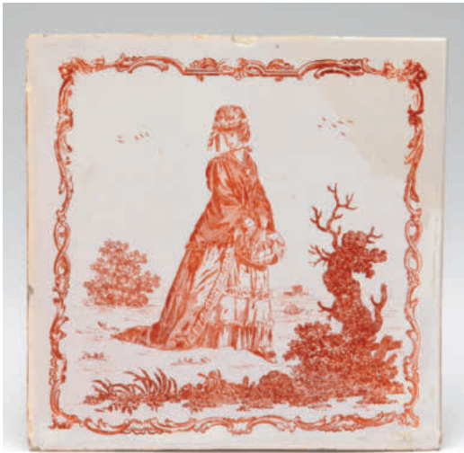
49. A Liverpool Delft tile, printed in brick red with 'The Pretty Mantua-Maker', within a scroll border, 5" square, circa 1772-75

The source of this print is a print by Grignion after Brandoin, published by Sayer 25 th September 1771