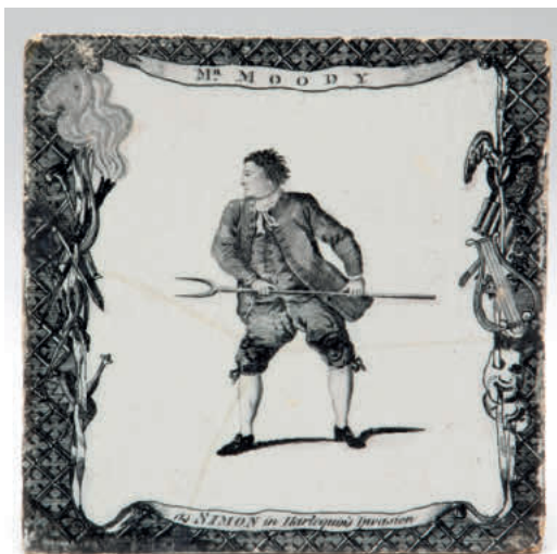
37. A Liverpool Delft Theatrical tile, printed in black with 'Mr Moody as SIMON in Harlequin's Invasion', within a titled trellis and trophy border, 5" square, circa 1777-80