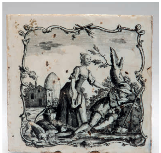
48. A Liverpool Delft tile, printed in black with The Overturned Milk-Pail, within a scroll border, 5" square, circa 1757-61

This tile is sometimes found signed J Sadler Pinxt