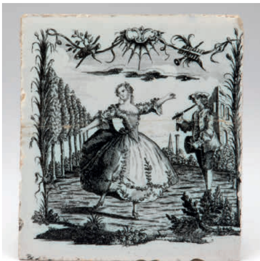
59. A Liverpool Delft tile, printed in black with Mlle Camargo dancing to a pipe and drum, beneath an arch of trophies, ribbons and leaves, 5" x 4 1/2", circa 1757-61

Provenance; Zeitlin Collection Norman Stretton Collection