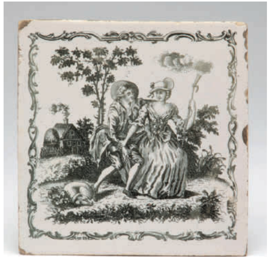
50. A Liverpool Delft tile, printed in black with A Shepherd Courting a Shepherdess, within a scroll border, 5" square, circa 1765-70

The source of this print is a print by Grignion after Brandoin, published by Sayer 25 th September 1771