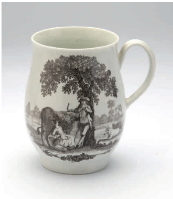
19. A Worcester baluster shaped mug, with notched loop handle, printed in black by Robert Hancock with Rural Lovers and Milking Scene (I), 4 ¾" high, circa 1765, no mark