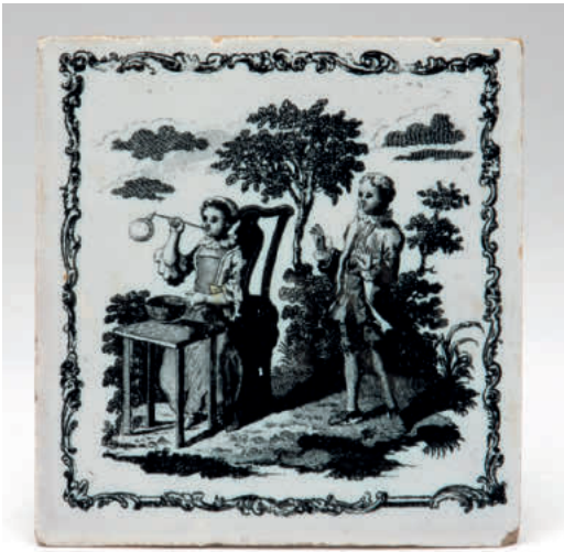
61. A Liverpool Delft tile, printed in black with A Boy Watching a Girl Blow Bubbles, within a scroll border, 5" square, circa 1757-61

This design is taken from John Bowles drawing book, Plate 39, the sheet dated 1 January 1757