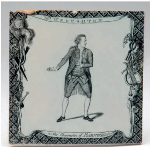
57. A Liverpool Delft Theatrical tile, printed in black with 'Mr Wroughton in the Character of BARNWELL', within a titled trellis and trophy border, 5" square, circa 1777-80