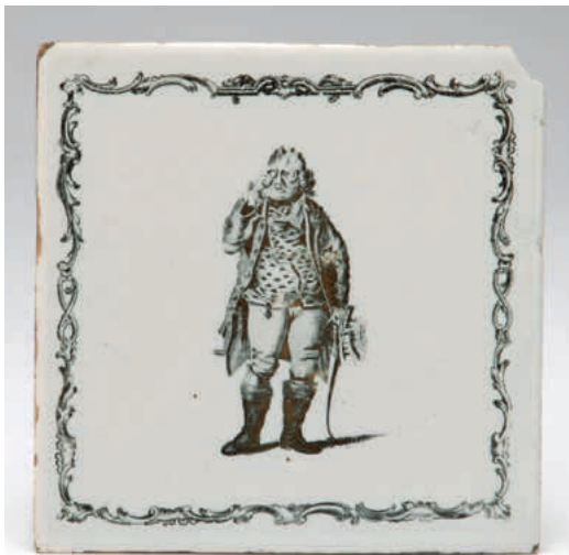
41. A Liverpool Delft tile, printed in black with A Macaroni at a Sale of Pictures, within a scroll border, 5" square, circa 1765-70

This design is from a print after Brandoin