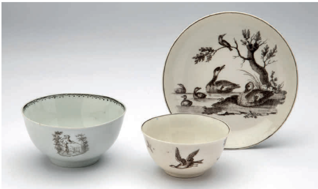
20. A Philip Christian Liverpool tea bowl, printed in black by Robert Hancock with Hunter, the reverse with Rock Garden, the interior with a black loop and dot band, 3 ⅜" diameter, circa 1768, no mark