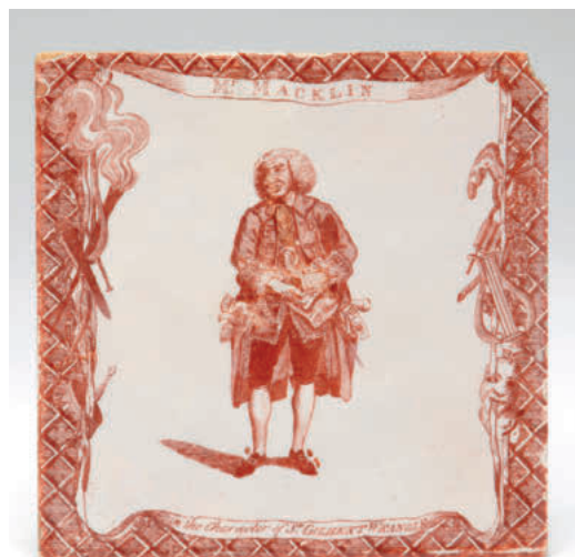
54. A Liverpool Delft Theatrical tile, printed in brick red with 'Mr Macklin in the Character of Sir GILBERT WRANGLE', within a titled trellis and trophy border, 5" square, circa 1777-80