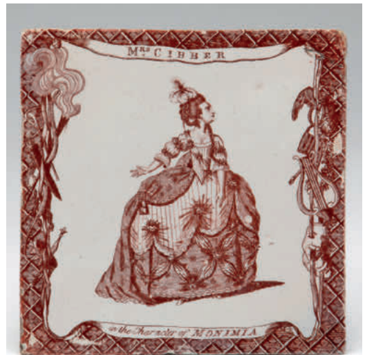
58. A Liverpool Delft Theatrical tile, printed in brick red with 'Mrs Cibber in the Character of MONIMIA', within a titled trellis and trophy border, 5" square, circa 1777-80

Provenance; Zeitlin Collection Norman Stretton Collection