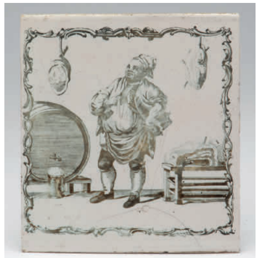
60. A Liverpool Delft tile, printed in black with The English Cook, within a scroll border, 5" x 4 1/2", circa 1765-70

This design is adapted from Laurent Cars' engraving of Lancret's picture of this subject, the original now in the Wallace Collection