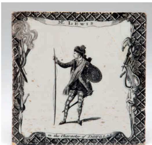
39. A Liverpool Delft Theatrical tile, printed in black with 'Mr Lewis in the Character of DOUGLAS', within a titled trellis and trophy border, 5" square, circa 1777-80