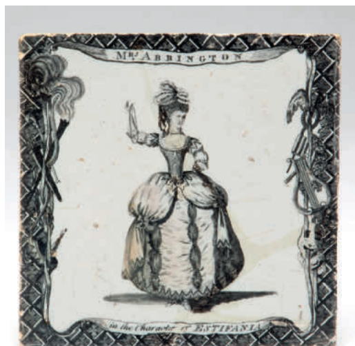
40. A Liverpool Delft Theatrical tile, printed in black with 'Mrs Abbington in the Character of ESTIFANIA', within a titled trellis and trophy border, 5" square, circa 1777-80