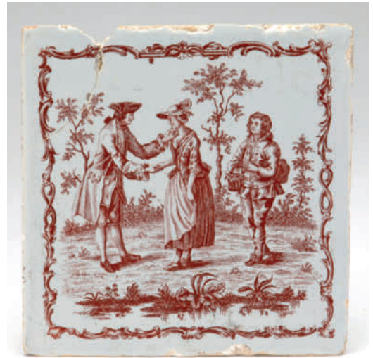
62. A Liverpool Delft tile, printed in brick red with A Gallant Chucking a Country Lass Under the Chin, Watched by a Boy, within a scroll border, 5" square, circa 1765-70

This design is taken from John Bowles drawing book, Plate 39, the sheet dated 1 January 1757