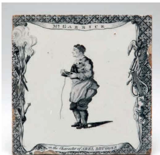
53. A Liverpool Delft Theatrical tile, printed in black with 'Mr Garrick in the Character of ABEL DRUGGER', within a titled trellis and trophy border, 5" square, circa 1777-80